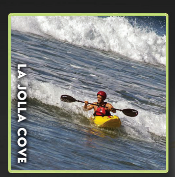
OCEAN KAYAKING 21 Minutes / 14 Miles