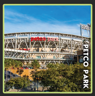
LIVE SPORTS & CONCERTS 22 Minutes / 15 Miles