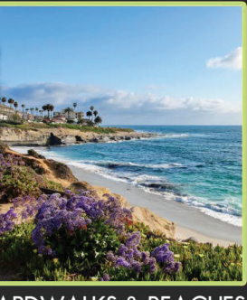
BOARDWALKS & BEACHES 23 Minutes / 15.6 Miles

JANUARY 7-8 FEBRUARY 11-12 MARCH 11-12 APRIL 8-9 MAY 13-14 JUNE 3-4