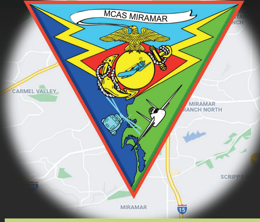
2025 EVENT DATES