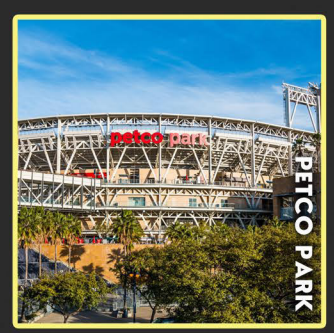
LIVE SPORTS & CONCERTS 22 Minutes / 15 Miles