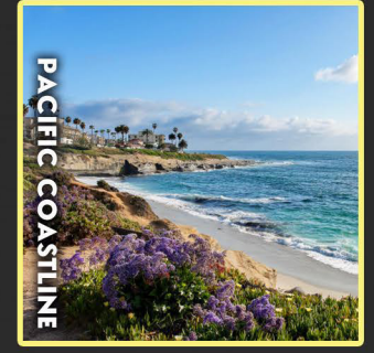
BOARDWALKS & BEACHES 23 Minutes / 15.6 Miles