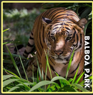
SAN DIEGO ZOO 20 Minutes / 13 Miles