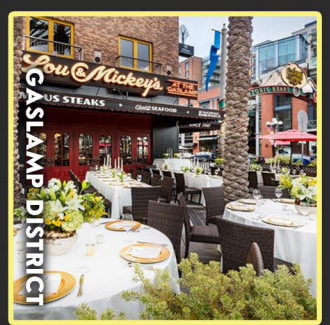
DOWNTOWN DINING 22 Minutes / 15 Miles