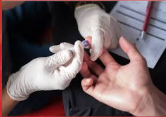
LIPID AND GLUCOSE TEST