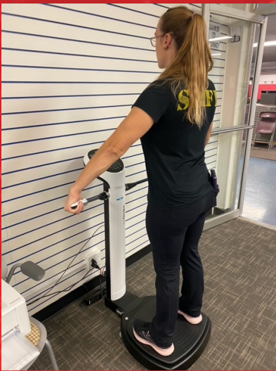
INBODY BODY COMP TEST